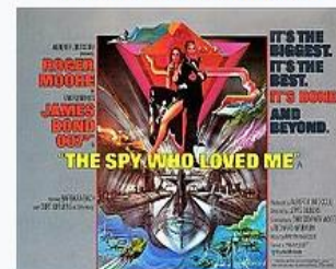
Theatrical release poster by Bob Peak